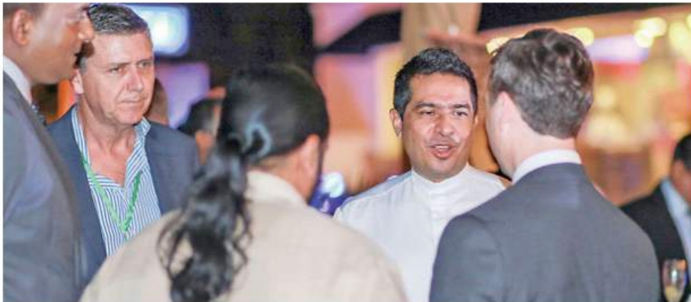
International Trade State Minister Sujeewa Senasinghe and Australian Deputy High Commissioner in Sri Lanka Tim Huggins were the guests of honour at the welcome reception hosted by the ICTA, at The Kingsbury Hotel

SLACC is the only integrated bi-lateral, member-based Chamber umbrella constituted under the Australian Chamber of Commerce and Industry to foster commercial trade and dialogue between Sri Lankan and Australian businesses; and are dedicated to providing practical and on-the ground support for business people who are entering or exploring the two markets.